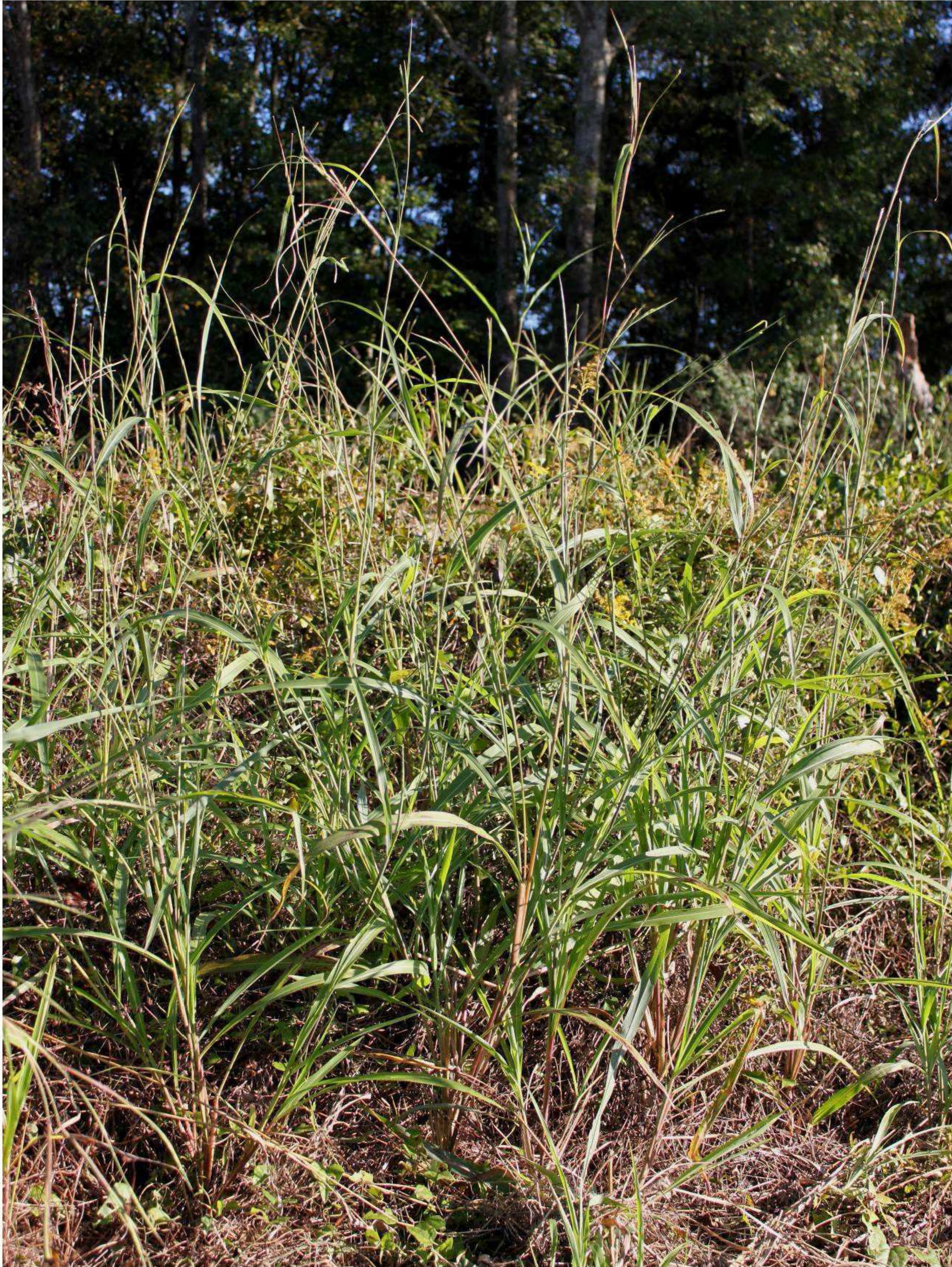
Figure 12. Rottboellia cochinchinensis (Poaceae).